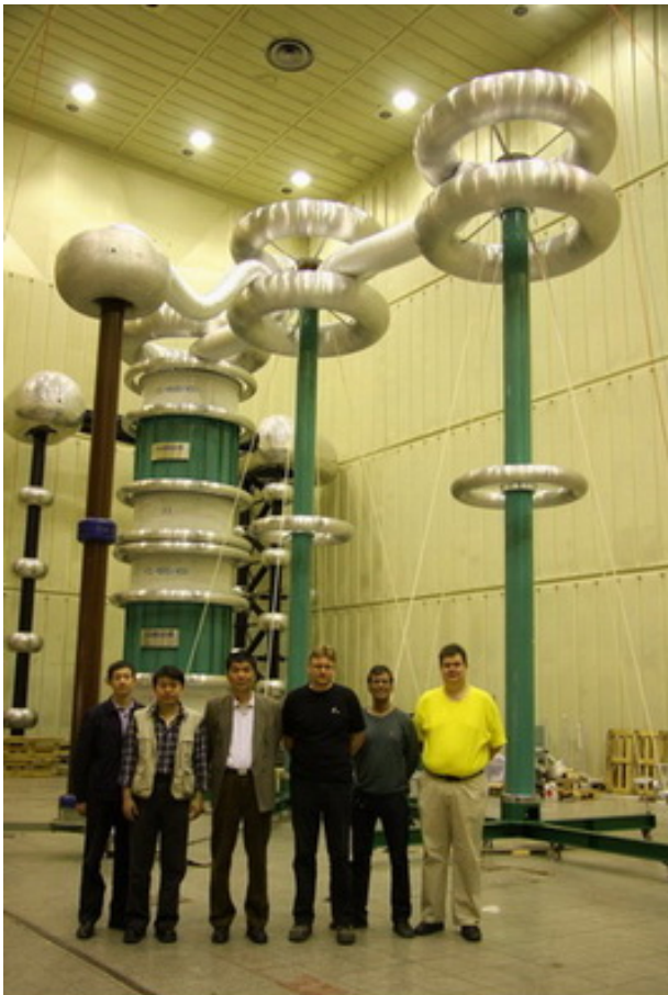
SGM3200KVA/800KV Helsinki University (Finland)