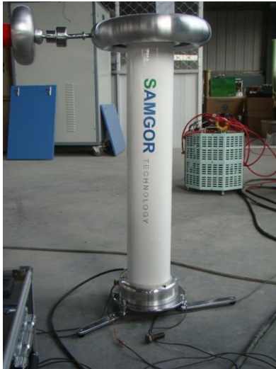
100kV (AC)/150kV (DC) RC Voltage Divider