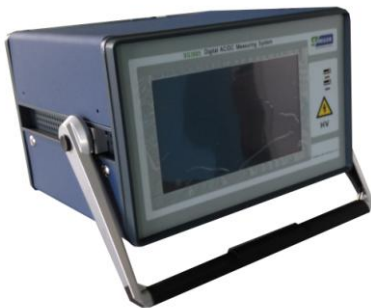
SG3005 Digital AC/DC Peak Voltage Meter

AC/DC KILOVOLTMETERS is an indispensable instrument in every modern high-voltage laboratory and test field where it occupies a wide range of important functions. It is the most basic test for every test in the high voltage test field.