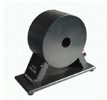
QS30A-1 Current transformer ( measuring range expander )