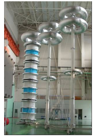
1200KV/3A Module Tunable Reactor Resonant Test System