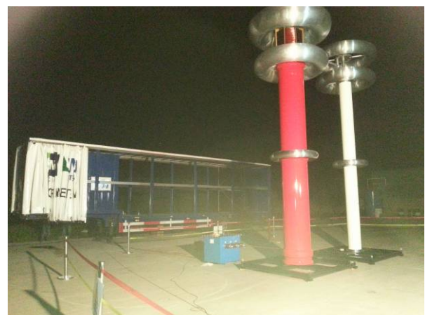
800kV/4A AC Resonant Test System