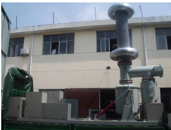
400kV/4A SF6 HV Test Transformer System